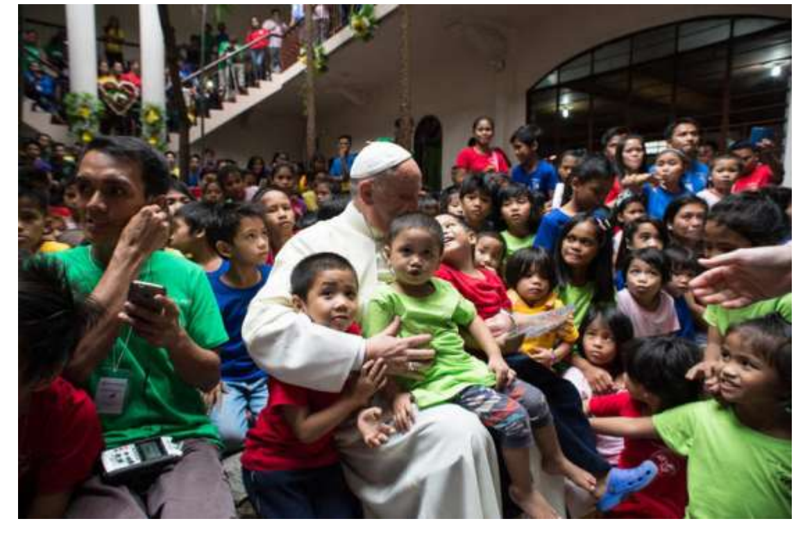
Pope Francis in PH: A look back at his 2015 trip to Manila, Leyte

In the meantime, the day-to -day running of the tiny Vatican City state will be