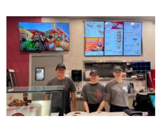
On the job training in Hospitality

Project Pathways To Prosperity is designed to support newcomers and underrepresented groups in bridging the gap between their international training, education, and experience and the expertise needed to work in progressive jobs in Ontario. This program provides access to training, financial support, and coaching, leading to certification and meaningful employment that are greatly needed in Ontario.