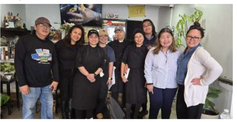
The owners, staff and four very satisfied Filipino customers at Nozomi.