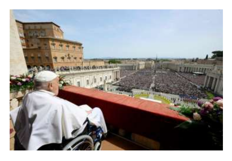
Pope Francis at the main balcony of St. Peter's Basilica during the Easter message "Urbi et Orbi" on April 20, 2025.