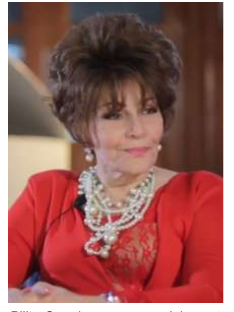
Pilita Corrales was a special guest in many Philippine TV shows. 2017

Pilita Corrales, known as the Asia's Queen of Songs, graced the Philippine music scene with her melodious voice and impeccable performances.