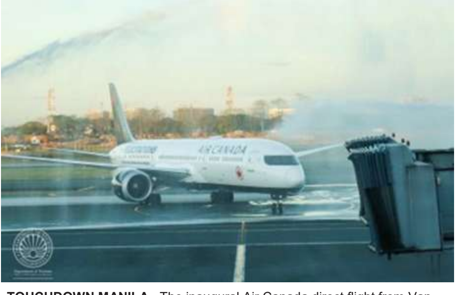
TOUCHDOWN MANILA. The inaugural Air Canada direct flight from Vancouver lands at Ninoy Aquino International Airport Terminal 3 Gate 116 in Pasay City at 6:04 a.m. Thursday (April 3, 2025). Air Canada will operate nonstop Monday, Wednesday and Friday per week throughout April and increase to four days by May.

"The launch of this nonstop flight is to significantly boost leisure and business tourism, further contrib-