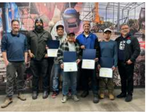
Home Renovation and Welding Course Graduates 2024