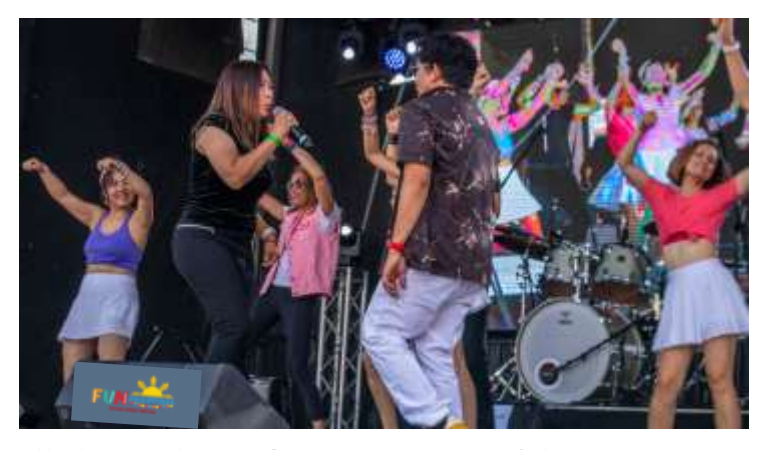
Singing, Dancing, Bands, non-stop FUN to rock Ottawa!

Entertainment at the Fun Philippines Ottawa Festival will be nothing short of spectacular. Following the success of Toronto's Fun Philippines festivals, Ottawa's event will feature nonstop programming and quality shows that have received rave reviews. Enjoy performances from cultural